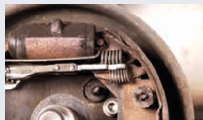
Old coil springs and brake shoes