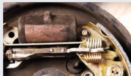
New coil springs and brake shoes

Worn coil springs in drum brake systems are a serious source of disturbance. Replacing them in good time ensures high spring tension, which is imperative for the brake to operate quietly and without vibration.