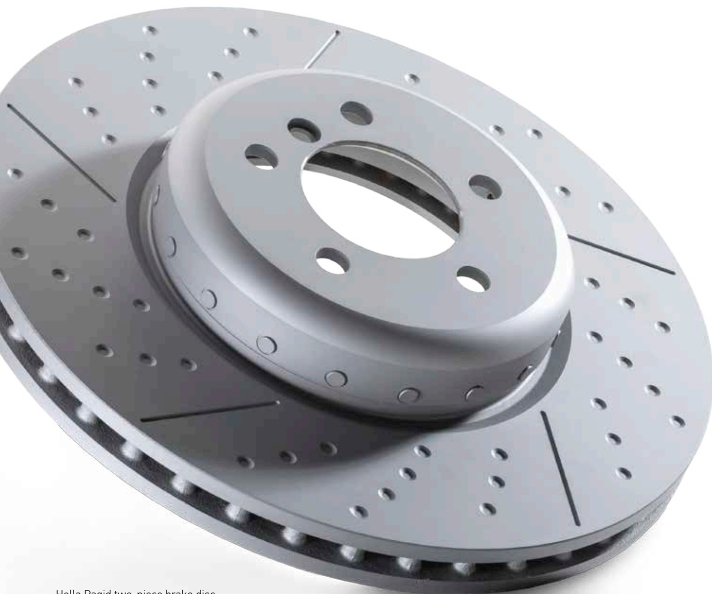
Hella Pagid two-piece brake disc

In these cases two-piece brake discs, also called composite brake discs, offer distinct advantages. Thanks to the diverse materials and special binding processes used in their manufacturing, these discs allow a decoupling of the heat flow to the wheel hub.