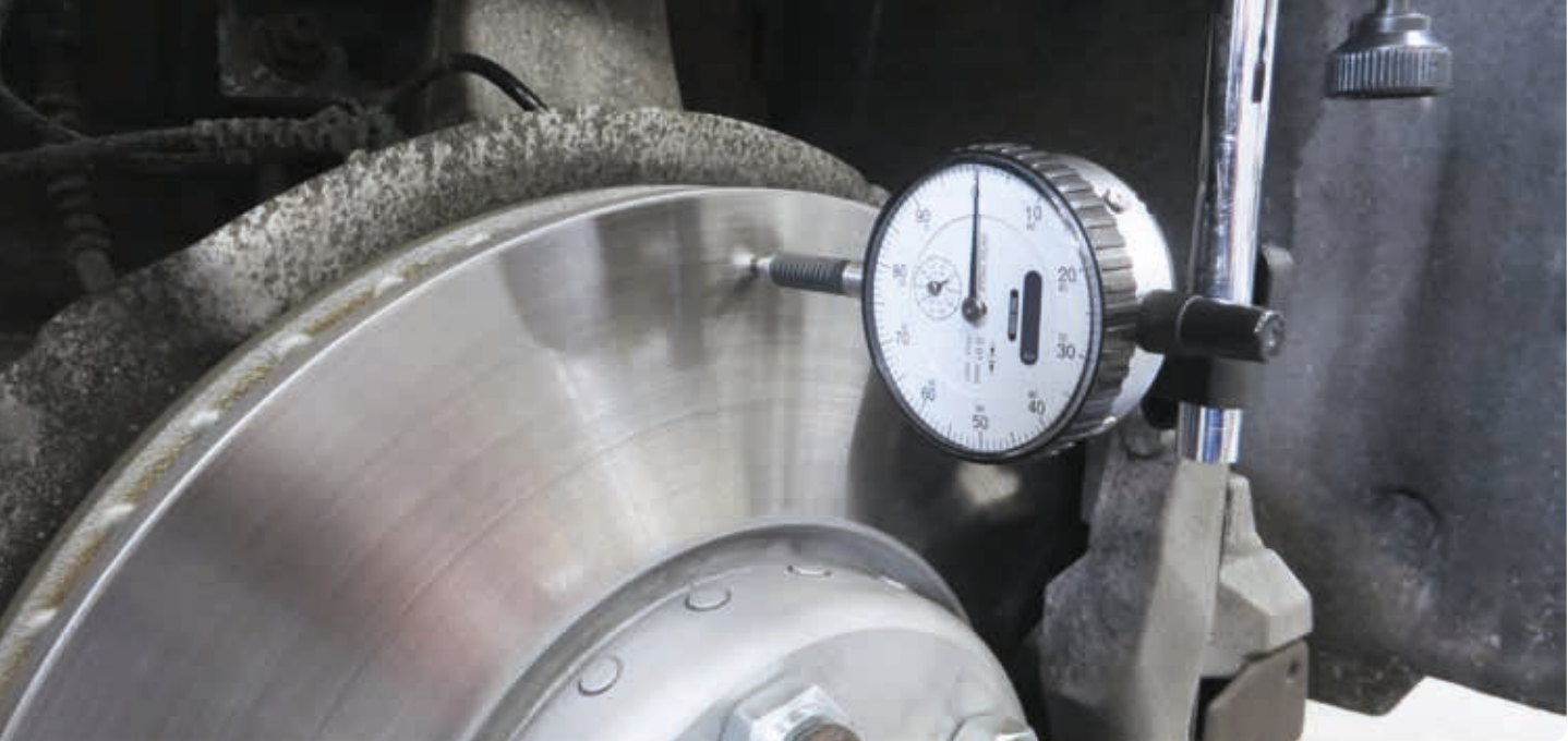
Testing lateral runout (judder) with a dial gauge