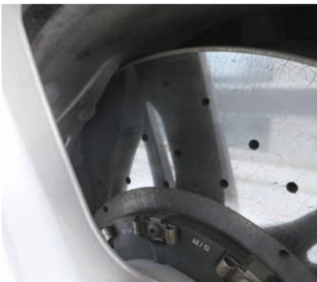
Audi ceramic brake disc