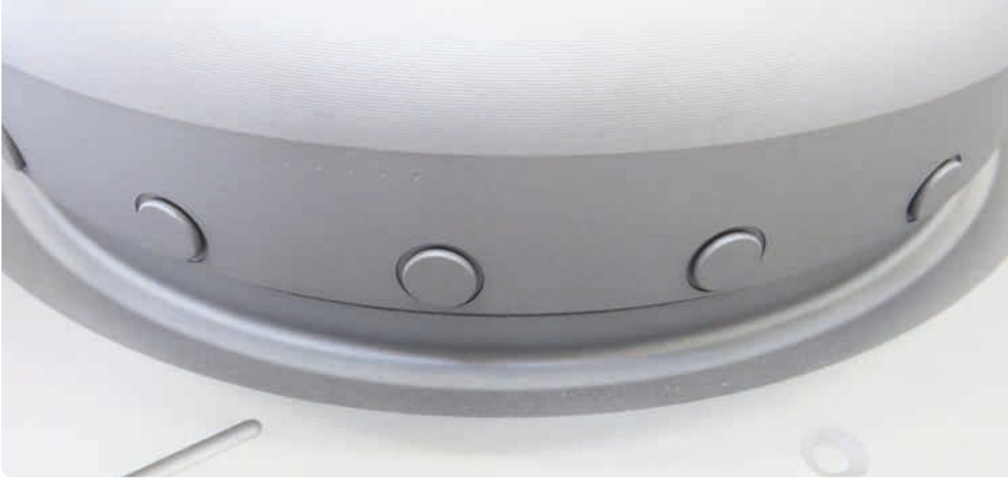
Joints with stainless steel rivets