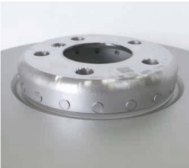
BMW composite brake disc with riveted aluminium disc chamber

On some of its vehicle models, Mercedes Benz uses composite brake discs with a disc chamber made out of sheet steel and a friction ring of cast iron. By means of a special construction, i.e. a toothed design, both components are joined together in a press fit assembly. The toothed profile of the brake disc chamber's outer casing half engages the matching toothed profile on the friction ring in order to bring about torque transmission. The brake disc chamber made of sheet steel is only 2.5 mm thick. A classic brake disc chamber usually has a wall thickness of 7.5 to 9 mm.