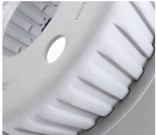
Mercedes Benz brake disc with splined disc chamber of sheet steel