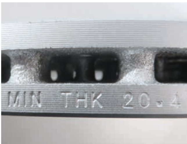
Indication of the minimum thickness on the edge of the brake disc

The appropriate tolerance values are fixed by each individual vehicle manufacturer and are to be strictly observed.