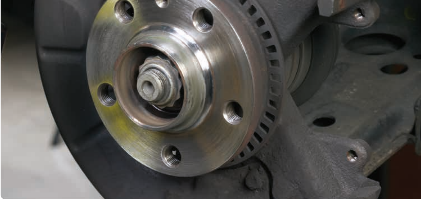
Prepared contact surface on the wheel hub